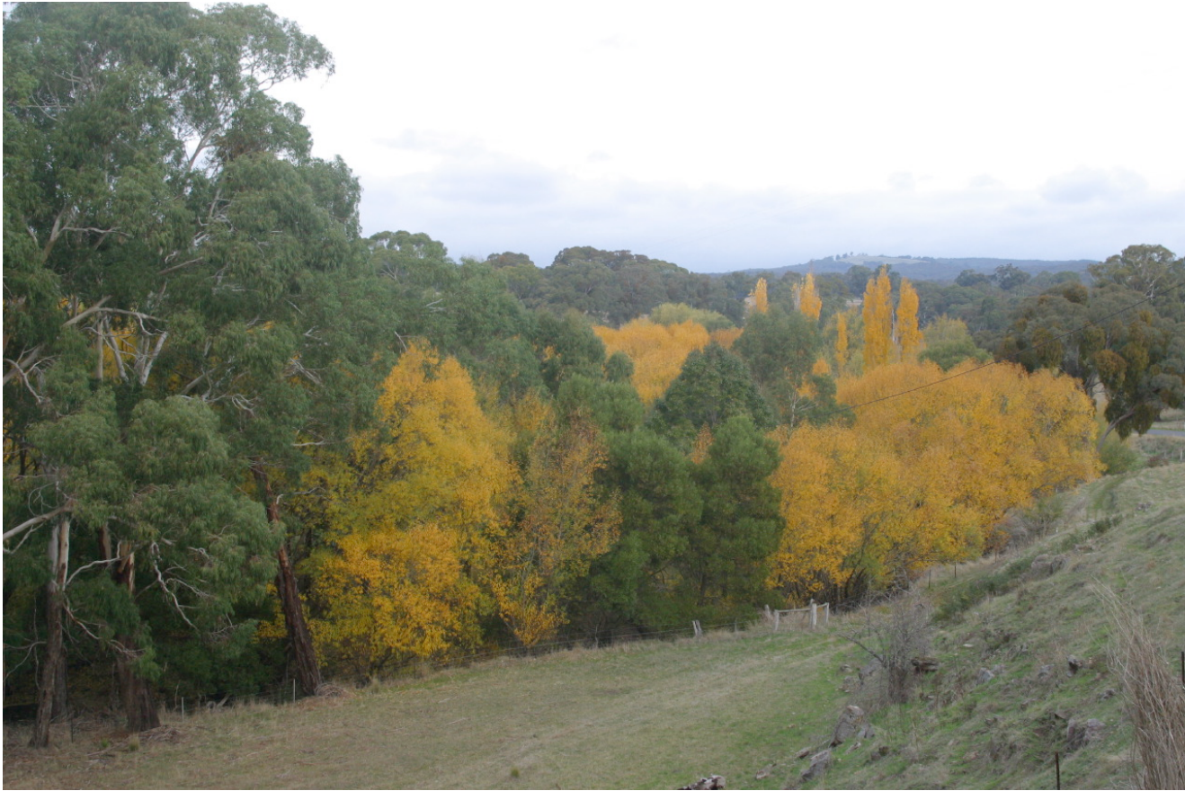
Jim Crow Ck at Shepherds Flat centra Victoria with mixed native and exotic vegetation including willows typical of grazing landscapes targeted for willow removal.

Over recent years willow removal projects have become a major component of Federal and State funded Landcare programs in south eastern Australia. This work is driven by willows (Salix spp) being classified as a Weed of National Significance<sup>1</sup>, and an extensive cross government network to co-ordinate action<sup>2</sup> including adding willows to the noxious weeds list (restricted from sale at this stage<sup>3</sup>). Most of these projects have been in high rainfall agricultural landscapes where willows form riparian forest corridors through grazing land. A smaller proportion has been in urban and peri-urban ungrazed landscapes radically changed by successive adjacent landuses and urban runoff. Some have been in high conservation value streams in national parks, although willow spread in these areas is relatively uncommon.