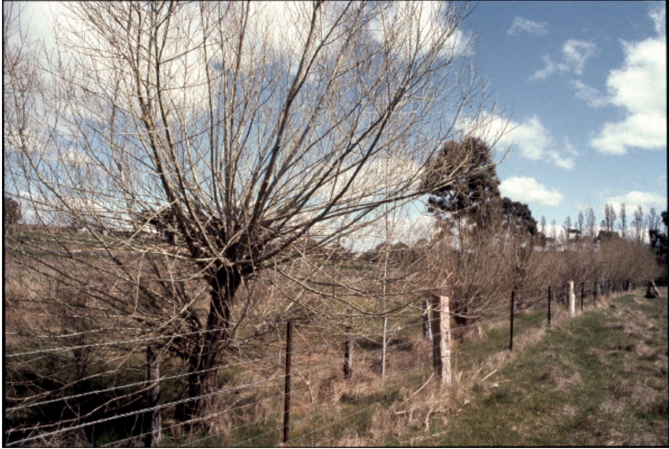
Willows pollarded for fodder Campbells Ck central Vic from Trees On The Treeless Plains HDS 1994

Depending on the rotation of cutting, pollarding substantially increases the amount of sun reaching the water and riparian zone. This allows for a more diverse aquatic ecology and the natural regeneration or supplementary planting of indigenous vegetation which is the main aim of removal projects.