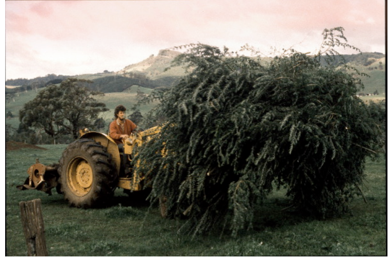
Moving tree fodder with front end loader Victorian Tree Crop nursery Ellinbank Gippsland 1988

Pollarding by hand with long handled double action professional forestry loppers can be very efficient cutting wood up to 40mm. Hydraulic lopper are an option. These willow wands up to 3 m from two years growth will fall freely to the stream bank for direct grazing by livestock following the cutting. Material which falls in the stream does not significantly increase likelihood of willow spread especially if cut in summer. If mob stocking is very brief with stock moved every day or two the impact on the stream banks and other established native vegetation would be minimal.